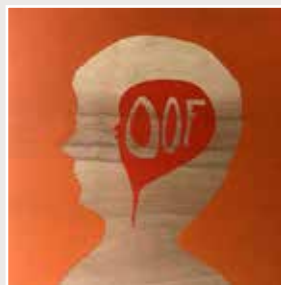
A Short Play for Long Days 15 x 15 • Acrylic on Panel

Saul works in a variety of media from oil painting to installation. His work is influenced by folk, modern and contemporary art. Saul's paintings, drawings, and sculptures are a reaction to the world around him – sometimes mundane, sometimes ironic and sometimes absurd with a sprinkling of dark humor and joyful misanthropy.