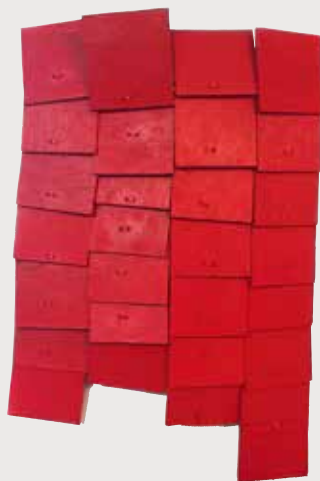
Study for Leviathan 18 x 12 • Acrylic on Panel