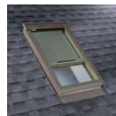
Solar battery lightblock shade